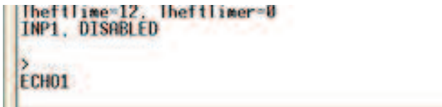
Screen View of Typing ECHO